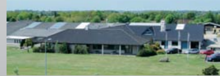
TIME DANMARK - VAN AND TRUCK MOUNTING