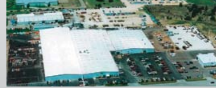
TIME MANUFACTURING COMPANY - CONDOR AND TRUCK MOUNTING DIVISION